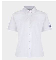
Twin Pack Shirt or Blouses