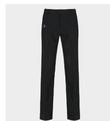
Trousers or Skirt