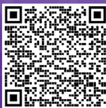
Barnsley Council Schools Admissions Information